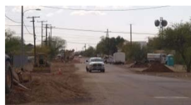
Papago Waterline Project

Projects expected to be completed this month include the Papago Waterline Project, Main Street Road Improvements, Quiet Zone Project, and the new Well #8. The Double Tree Expansion continues and the General Plan Update is scheduled for completion this month.